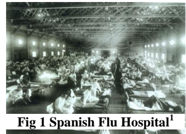
Fig 1 Spanish Flu Hospital 1

The question then for the creationist, who believes in the “perfect” creator, is how this “hostile external environment” and the “unfortunate evolutionary legacies” came to be? The longevity of the antediluvian ancestors as documented in the Bible and confirmed by the Babylonian Kings list, clearly indicates that this environment and legacy was not always the case. The 600+ year lifespan of these forefathers [Gen 4 & 5] and the ominous declaration by the Lord in Gen 6:3 against humanity, “yet his days shall be an hundred and twenty years.” are sobering to say the least. 1